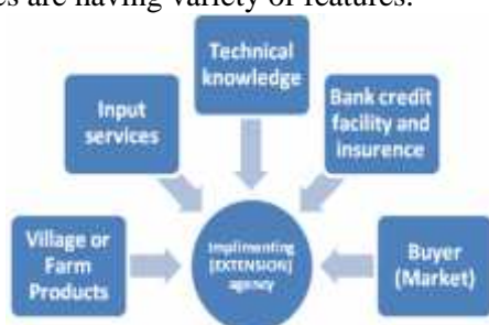
Fig 2: Implementing agency coordinating stake holders in the process of model village creation

India through agricultural and rural technologies by this model village concept. Obviously role of extension is very important here to work as an implementing agency to identify the villages, analysis of their situation, resources, providing training for various developmental aspects like Entrepreneurship, marketing, processing, educating them for usage of ICTs, collaborating various organizations may be credit, marketing and maintaining the relations etc. By developing entrepreneurship we can have a range of products from village cottage industry to the exportable village products. Here extension efforts can be maximized by coordinating other organizations and its role will be diversified because various villages are having variety of features.